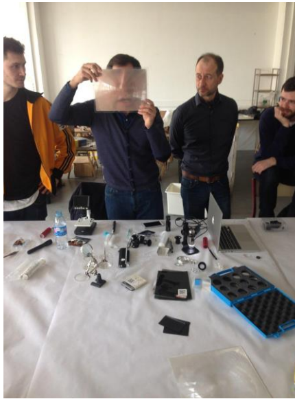
Figure 1. The physicist manipulating an optic refraction artefact and doing a demonstration to the student with the designer teacher on his left.

The first lesson was followed by a session where students could manipulate scientific tools: magnifying glasses, lenses, mirrors, two or three traditional microscopes, small USB microscopes (which were connected to the computer), polarizers, flashlight, UV lamp and laser (e.g. Figure 1 & 2).