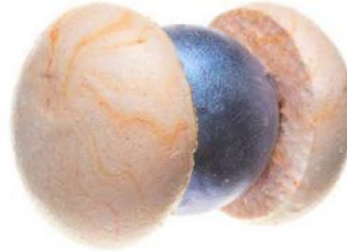
Figure 6. Detail of one of the combination for H 2 O, using biscuit for Hydrogen, and chocolate for Oxygen