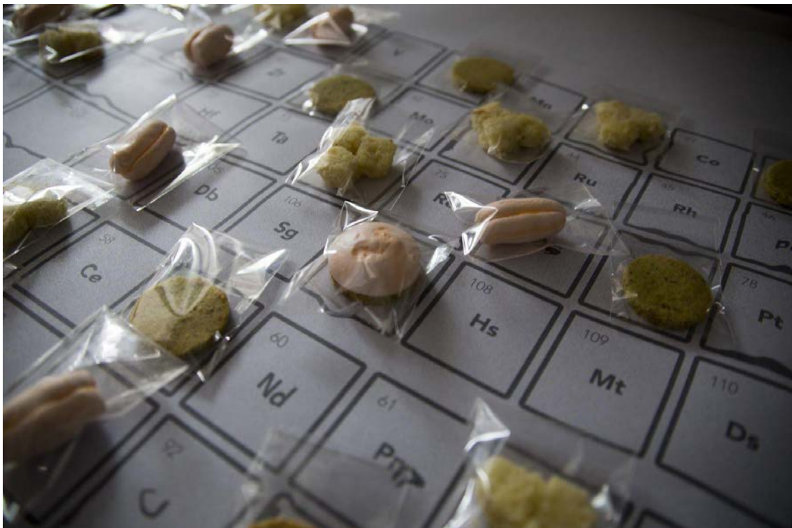
Figure 4. the student B “pasty cosmology” as it was displayed at the final presentation, the cakes were tasted arranged in the Mendeleev table used as a tray.

For example, through his use of materials B wished to change both the relation to a cooking recipe and the symbolic representation of the periodic classification (e.g. Figure 4). However, the implementation of the project was not without certain pitfalls, especially in the assembly of the elements, conditioned by their chemical composition and the properties adjoining their materiality. Hence, B selected 5 substances, which he tried to combine according to an experimental protocol. Since this assembly was not possible from one material to another, the productions finally presented were dictated by the possibilities and the resistances of the material. In the interview, B pointed out the “surprising combinations” of all natural elements and at the same time stressed that the “chemical compositions [of these elements] are much closer than what first appears”.