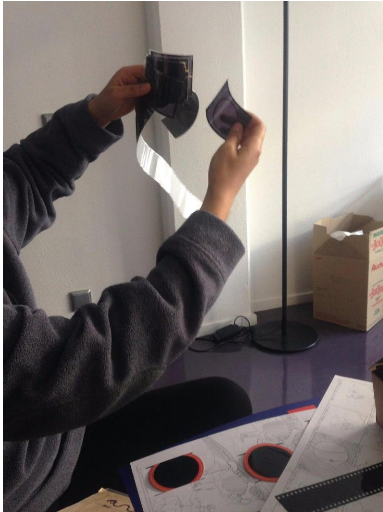
Figure 3. Student A handling different type of photographic films, comparing the transparency, the sharpness and the possibility to change the scale.

by Manu Prakash & Jim Cybulski in 2012, it is an open source microscope made of paper, downloadable in pdf, and hand-assembled with the addition of an optical lens). ” I just wanted to see how it works, and understand how to build it.” From there, she began an inquiry about optics and printed images, going successively from digital to analogical production of images in order to find a good way to change the scales of the details she wanted to show (e.g. Figure 3).