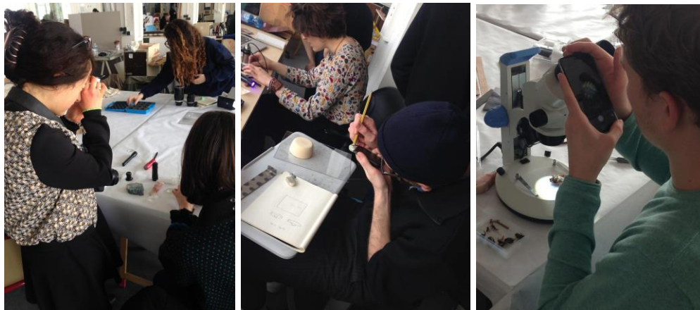
Figure 2. Students experimenting the different instruments and optical lenses and microscopes brought by the physicist

In this propaedeutic stage, students tackled the complexity of the paradox using different