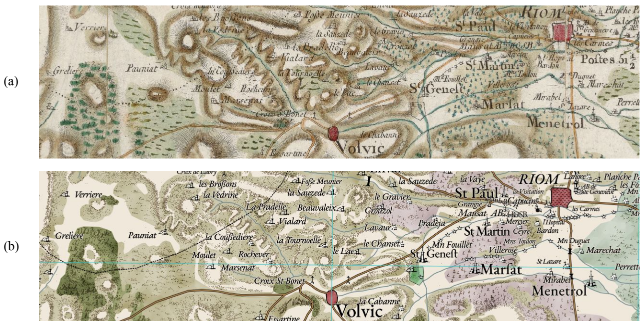
Fig. 2 (a) a view on the original Cassini map of France (sheet 52, 1759-1777) and (b) the extracted vector data mapped with the "Cassini" map style (2019).