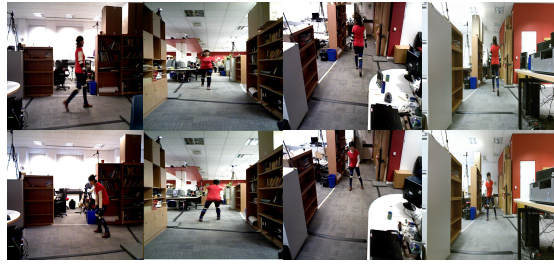
Fig. 2. Sample frames from the proposed dataset from four different viewing directions for turn-walk (top row), and limp action (bottom row).

timate. The overall approach is illustrated in Figure 1. The major contributions of our method are its ability to determine and score movement abnormality (in a healthcare setting) from any reasonable viewpoint given an RGB video and without relying on explicit 3D (skeleton or depth) information. Further, we introduce a new fully annotated multiview and multimodal dataset that will be available to the community for the development of health-related or rehabilitation methods. To the best of our knowledge, it is the first time that features extracted from single RGB images are demonstrated to be suitable for movement quality analysis in a healthcare application.