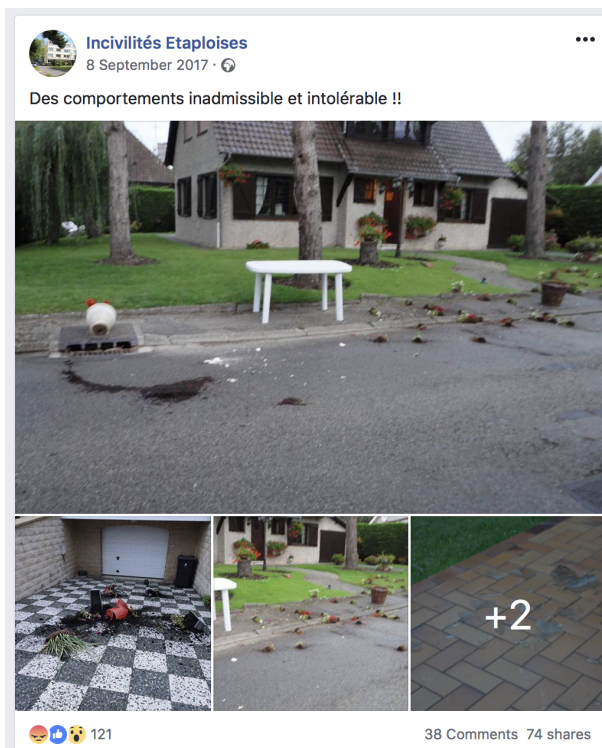
Figure 2. ‘Incivilités étaploises’ Facebook page, captured 11 September 2017. Status translation: ‘Unacceptable and intolerable behaviour!!’.

Analysis of the page over a two-year span shows that, despite periods of lesser activity, the posts shared on the page (predominantly by the page owners) often trigger a fair number of reactions and comments – with peaks between 20 and 70 comments. The data allows us to track the publications which generate the most reactions and assess the nature of the interactions. It appears that contributors generally vent their anger against alleged examples of incivility or insecurity, sometimes in quite crude terms, sometimes criticizing the local authorities for their lack of reaction. On the other hand, users who either follow this page or have just discovered it can be quite critical of the initiative, or deride it and make fun of the page.