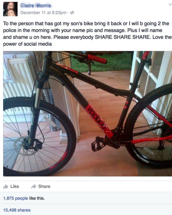
Figure 5. Facebook publication, captured 28 December 2015.

hot [to] handle. Thanks.’ Shortly afterwards the user wrote in the comments: ‘Thanks 2 the power of social media we now know who has my sons bike the only problem now is finding him’. In a second post on December 11, 2015 (figure 5), the user shared the picture of the bike again, this time with a more threatening status: ‘To the person that has got my son’s bike bring it back or I will b going 2 the police in the morning with your name pic and message. Plus I will name and shame u on here. Please everybody SHARE SHARE SHARE. Love the power of social media’. The post was shared over 15,000 times in about 10 days.