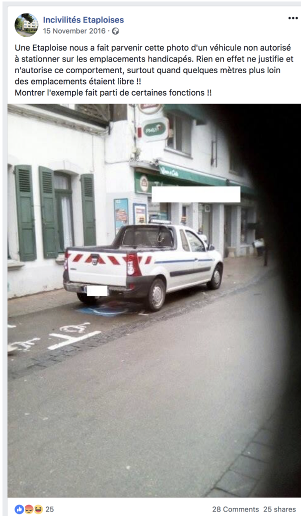
Figure 3. ‘Incivilités étaploises’ Facebook page, captured 10 July 2017. Status translation: ‘A woman from Étapes has sent us this photo of an unauthorised vehicle parked on the disabled space. Indeed, nothing justifies nor authorises such behaviour, especially when there are free parking spaces just a few meters away!! Showing a good example should be part of certain functions!! [the vehicle belongs to town hall employees who are doing repair work]’.

recognize their own or their neighbours' property (such as a car or a vandalized space) and attempt to justify their actions, thus leading to heated discussions in the comments (figure 3). Some users admit to following the page only in order to check if anything is being said about their vicinity or themselves.