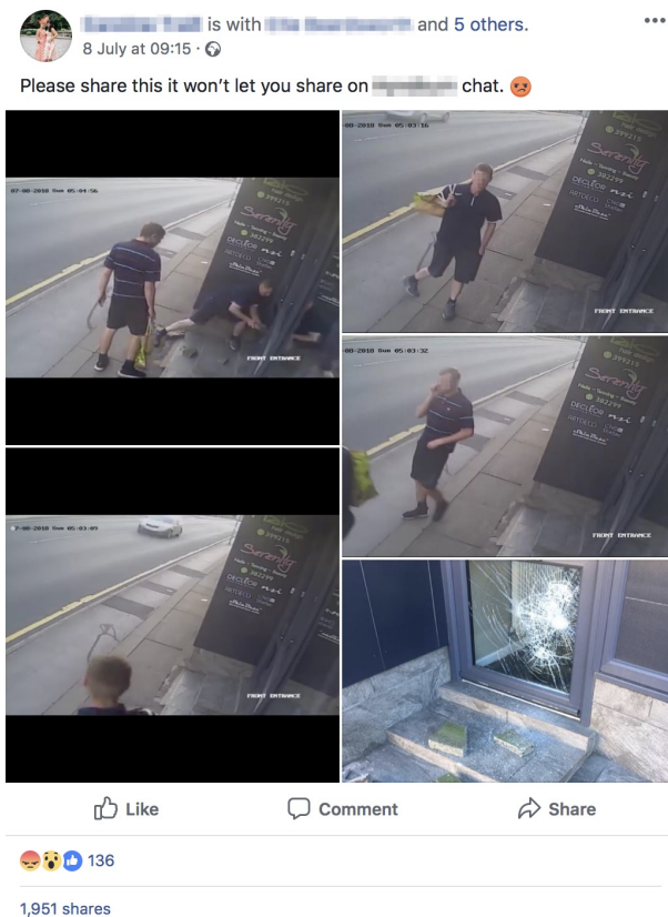
Figure 4. Facebook publication, 8 July 2018 (faces have been anonymised but are visible on the original source).

Both previous examples involve a security crisis, however websleuthing more commonly takes place when prominent criminal cases remain unsolved. It can garner a fairly important number of participants via ad hoc means such as Facebook groups, forums, or dedicated websites. The digital environment becomes both a shared space to discuss the matter and to organise, and a resource where information can be gleaned. Other more mundane forms of investigation may also take place over social media. These involve the simple sharing of a message, for instance on Twitter or on Facebook, calling for help to identify the authors of petty crimes such as vandalism or theft. The message can include a picture or video of the suspects if caught on camera, or of the stolen object or vandalised place, and often presents a local character. In one example (figure 4), CCTV footage of two young men trying to break into a shop has been shared nearly 2,000 times over Facebook, mainly among people belonging to the same local borough in the North of England.