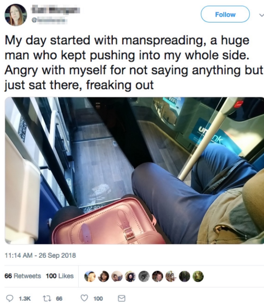
Figure 1. A picture taken on a UK bus and shared on Twitter, captured 16 November 2018.

In all these cases, the individuals who are shamed in such situations are generally not recognizable: their face is outside the frame or cropped out, very little elements of context are provided, they are normally unaware they have been caught on camera, and the circulation of the images is limited. The aim therefore is not to identify them directly, or to confront them with the recorded behaviour. However, from the comments that are generated by the shared images, it appears that some degree of satisfaction is derived from exposing behaviours which may be considered either ‘unacceptable’ or ‘deviant’, even though their authors are oblivious to what is happening. The (anonymized) humiliation still constitutes a form of mild punishment in the eye of the beholder, as well as sometimes an assertion of moral superiority by making fun of these attitudes. Due to this anonymity, the consequences for the persons involved are minimal, and the flagging only generates a small amount of controversy if at all. Rather than a targeted assault, it represents an impersonal call to change an attitude or to fall back in line, a mild threat which can also often be associated with a form of humour or sarcasm as the blameworthy behaviour is derided.