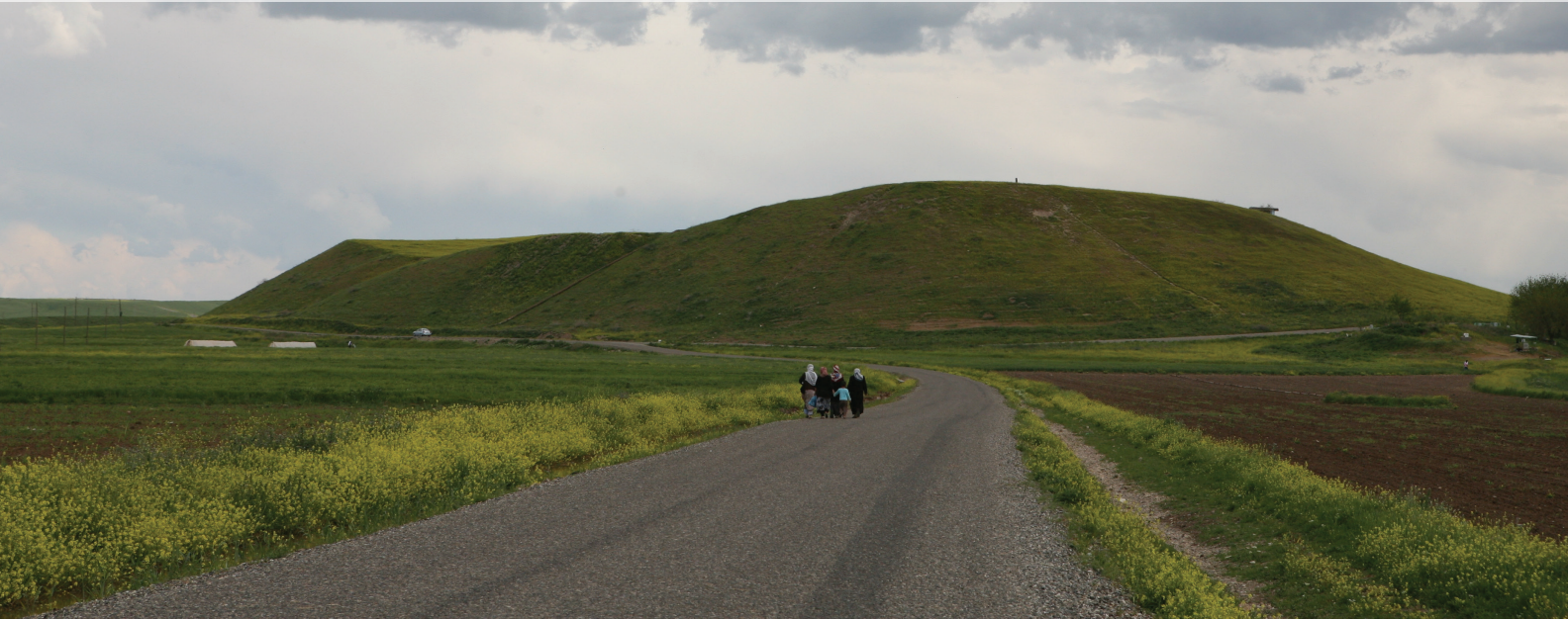
Figure 1. Eastward view of the mound of Ziyaret Tepe.