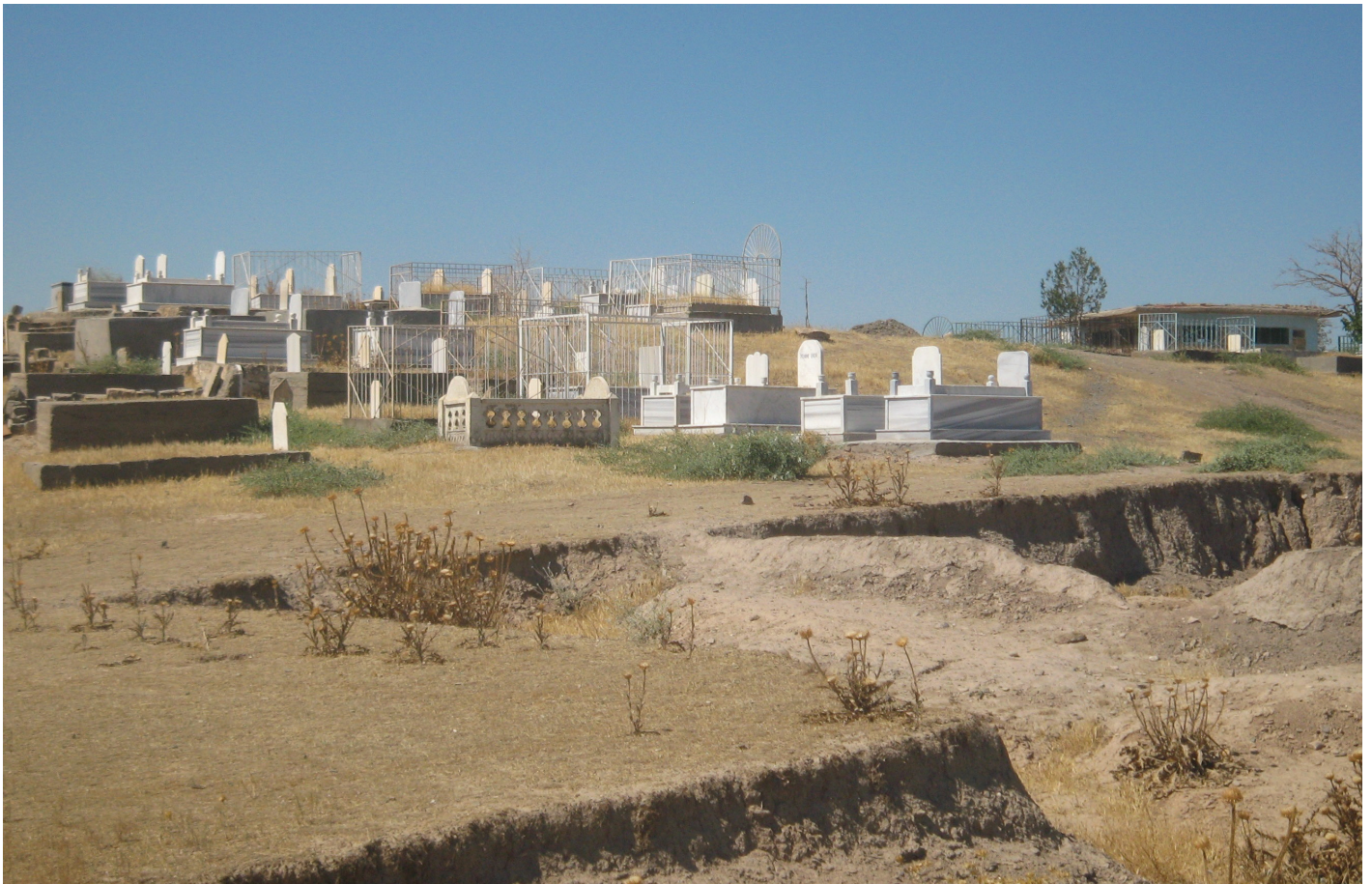
Figure 4. The cemetery located atop the Ziyaret Tepe mound, adjacent to the excavation trenches.

greatly influenced the social and economic trajectory of each town. On the one hand, as a district center (or belediye ), Bismil profited from the business and amenities generated by state investment, including new roads, schools, and banks, as well as a post office and hospital. On the other hand, Tepe's denizens would not witness major infrastructural development, such as electricity, until the 1980s, when the migration of people caught in the conflict between the Turkish army and the Kurdish Workers' Party (PKK) dramatically increased Tepe's population. It is within this political history, as representatives of both a histori-