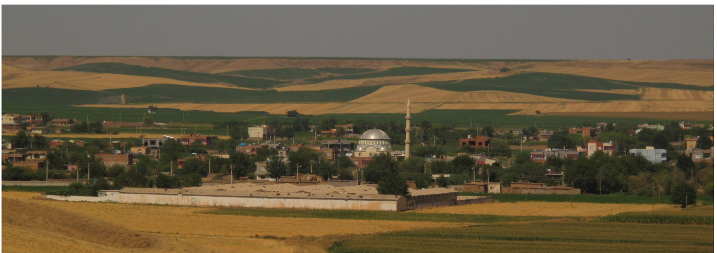
Figure 3. View of the village of Tepe from the mound of Ziyaret Tepe.