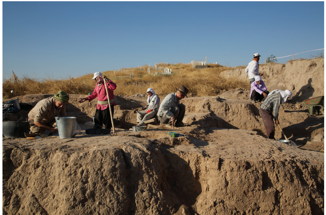
Figure 5 (above). Excavation on the high mound, with the cemetery in the background. Figure 6 (below). Excavation in the lower town of Ziyaret Tepe, with the high mound visible in the background.

Into this already complicated foray entered the archaeologists who come to Ziyaret Tepe with their own set of objectives and obligations; namely, to conduct scientific research of academic value by the rules set forth by the Ministry of Culture and Tourism. Tasked with the power to explore the mound of Ziyaret Tepe (fig. 6), they depend upon the Ministry for access to the site and upon the regional museum for a great deal of support and resources, including storage facilities and artifact curation. The overriding authority of the Ministry and the project's reliance upon the museum attenuated the director's ability to alter archaeological practice and easily accommodate the unexpected funeral. The meeting consequently exposed a latent limitation of all archaeological work conducted under state license: despite the unique concerns of individuals, organizations, or institutions involved in the research, the site is ultimately the property of the state and