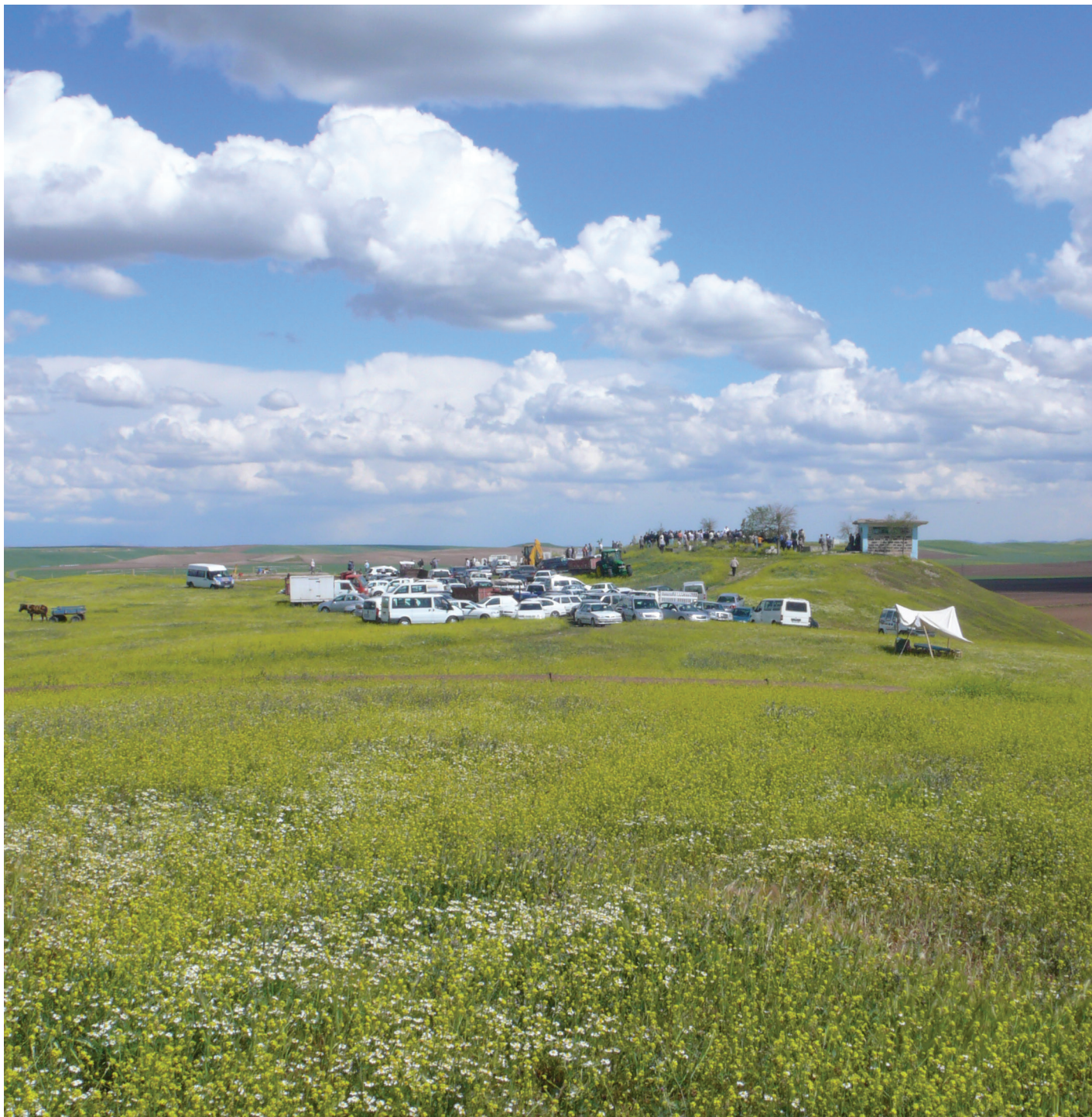
Figure 8. The funeral taking place on the high mound of Ziyaret Tepe.

The collaboration achieved good will on all sides, even though the group that gathered to discuss the funeral had to confront competing claims and conflicting commitments. We would like to emphasize that the concession to non-archaeological pursuits did not undermine the overall scientific project, and in fact garnered a greater respect for the excavation and its team members. Nor was the achievement in community relations one-sided. The archaeologists, too, gained from the experience. By valuing the local community's understandings of and interactions with Zi-