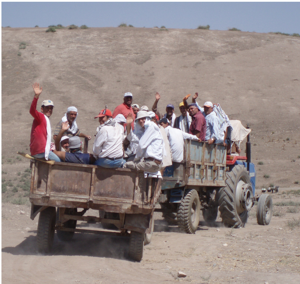
Figure 7. Villagers hired as laborers headed to the mound of Ziyaret Tepe.

arriving in Tepe, the project has become a major seasonal employer for the village (fig. 7), providing a much-needed source of revenue during this particularly slow season. Modern water management systems have since become widespread in Tepe's fields, making summer cropping jobs more available; but the expectation of work on the archaeological project remains and the excavation regularly employs around sixty men, some of whom have been with the project for many years.