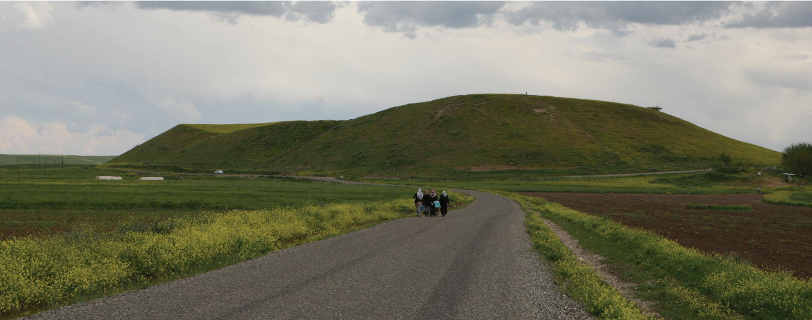
Figure 1. Eastward view of the mound of Ziyaret Tepe.