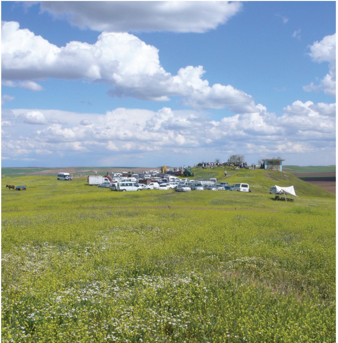
Figure 8. The funeral taking place on the high mound of Ziyaret Tepe.

The collaboration achieved good will on all sides, even though the group that gathered to discuss the funeral had to confront competing claims and conflicting commitments. We would like to emphasize that the concession to non-archaeological pursuits did not undermine the overall scientific project, and in fact garnered a greater respect for the excavation and its team members. Nor was the achievement in community relations one-sided. The archaeologists, too, gained from the experience. By valuing the local community's understandings of and interactions with Zi-