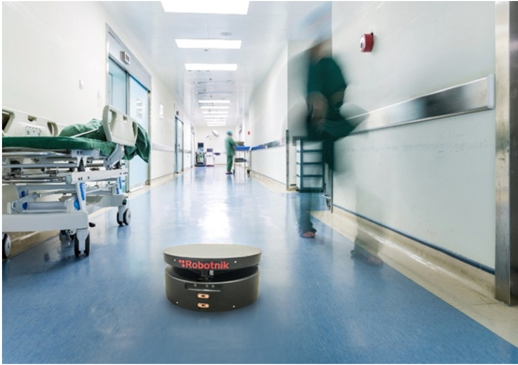
Figure 1: RBI-base robot navigating in a healthcare environment (‘Robotnik - Mobile Service Robotics | Robotnik’, 2018).