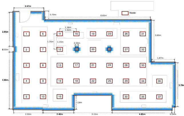
Figure 2: R2lab topology