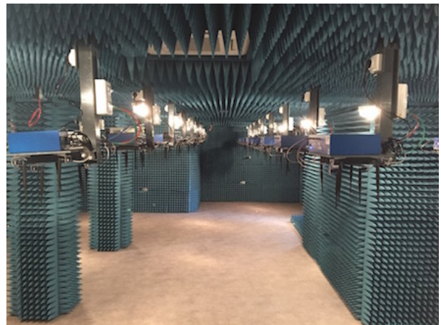
Figure 1: R2lab room

Room characteristics. The R2lab platform sits in a 90m 2 insulated anechoic chamber located in a basement of a building at Inria, Sophia Antipolis, France. Figure 1 shows a snapshot from inside the room and Figure 2 the topography. It hosts thirty-seven PC nodes on the ceiling scattered on a fixed grid; more than half of the nodes feature an SDR board, of various kinds. Such an environment