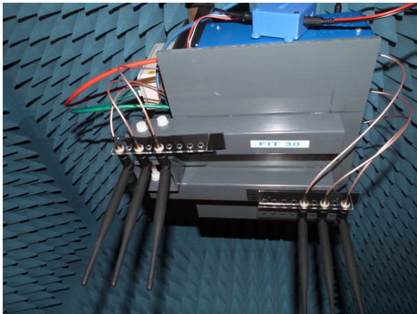
Figure 3: Wi-Fi dual-band antennas for a node

To control and monitor each Icarus node, we use the NITlab’s Chassis Manager Card (called CM card); this device embarks a tiny web server that can serve HTTP requests to power on/off and reset the motherboard, or one attached USB device.