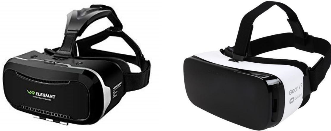
Figure 2. VRElegant Passive HMD on the left and Samsung Gear Active HMD on the right

It is also easy to add an extra USB cable for our evaluation. VRElegant has a field of view about 96 degrees.