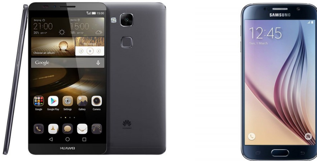
Figure 3. Left Huawei Mate 7, right Samsung S6

However, since the USB port was not available on the SamsungGear, we explored another method of communication which consists of flashing the smartphone torchlight at each stimulus. The resulting physical flash is then converted to a numeric tag thanks to a photodiode connected to the EEG acquisition system. In practice, this method is less robust than the USB tagging since there is only two possible values (flash or no-flash) and it is also prone to losing some of the flashes. It also introduces a higher jitter in comparison to the USB tagging under PC or VR ( Figure 4 ).