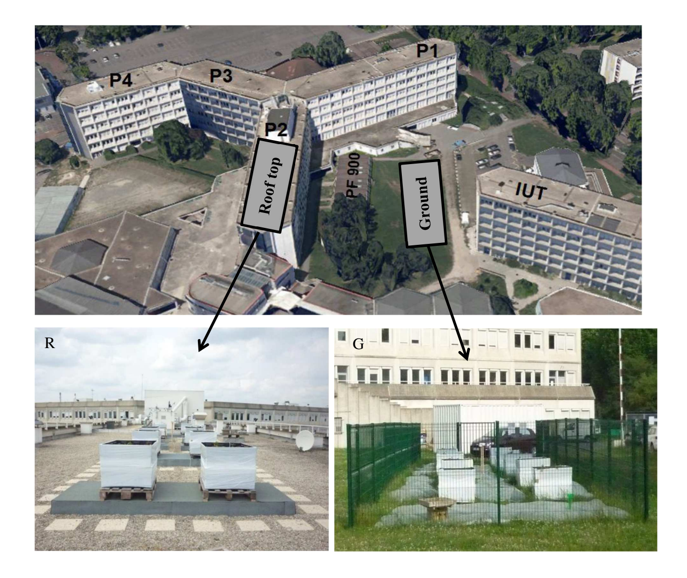
Figure 1: Experimental design at the University of Paris Est Créteil, Val de Marne (Ile-de-France, south east of Paris)