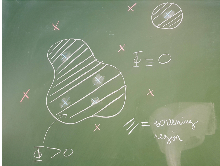
FIGURE 1. Exclusion rule. The blue points generate a screening region (dashed white). No other (red) point of a minimizing configuration may lie within it.

3.3. Sketch of proof for Theorem 3.1. We present the four main lemmas of the proof and a few explanations of how they fit together. See [26, 27] for more details. The method is rooted in potential theory.