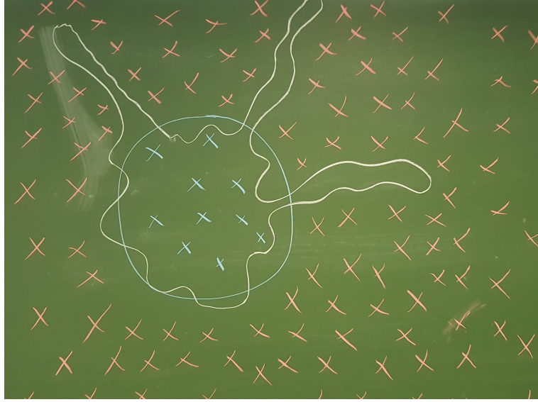
FIGURE 3. Pathological configuration, to be excluded. The blue points inside the (blue) circle generate a screening region (inside of white line). It sends tendrils out to infinity, while still avoiding the other (red) points.