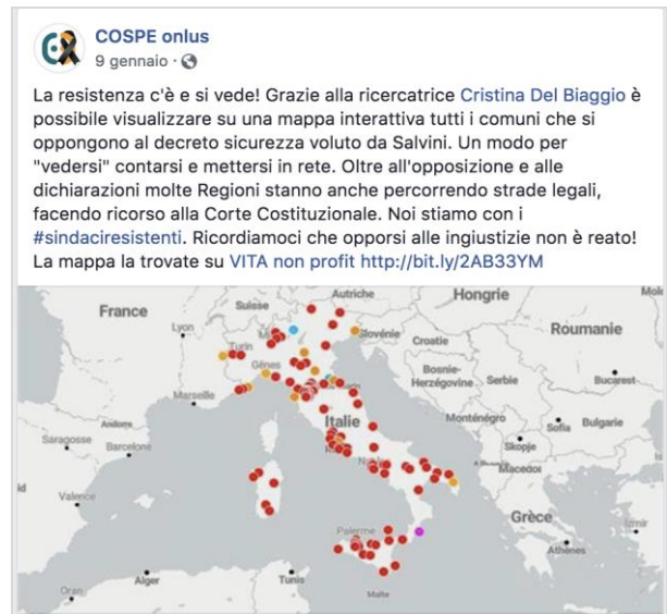
Figure 10. “Resistance does exist and you can see it!”.