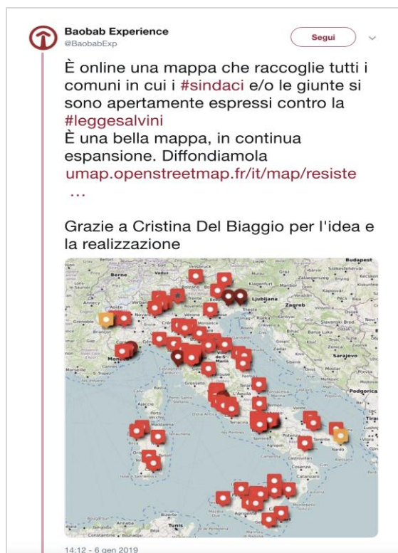
Figure 4. Sharing the map.