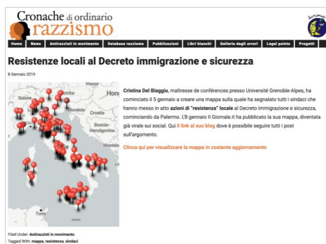
Figure 7. Symbolising the map.

Beyond its proper visualisation, the map has come to symbolise an anti-racist standpoint (Figure 7). Living in the Web through different forms of mediation, the map began not only to attract comments but it came also to activate relations and “inter-actions” (Figure 8).