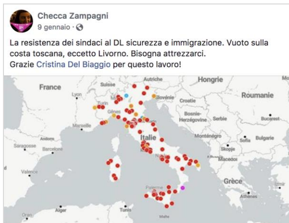
Figure 9. “Empty space on the coast of Tuscany, except for Livorno. We need to gear up”.