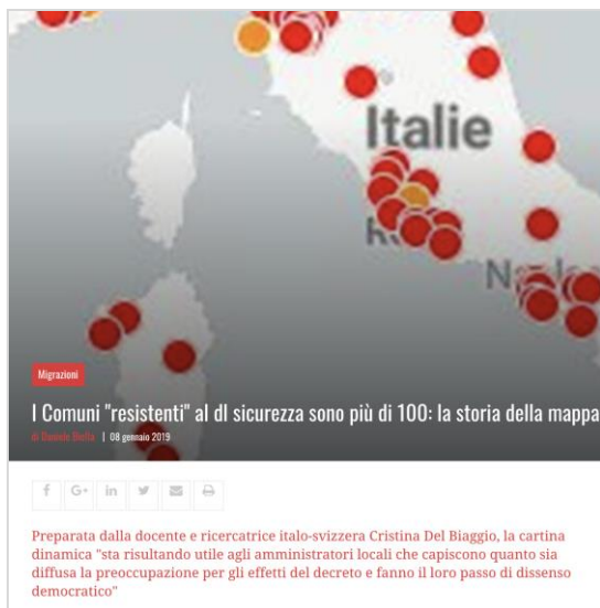
Figure 3. Telling the story of the map.

Local resistance to Salvini's legislative decree, 100 and counting. In a few days more than one hundred Italian Municipalities advanced clear actions against the application of the legislative decree on immigration and security which was enacted by the Italian Government in the Fall of 2018 and is raising serious concerns for its impact on the rights of migrant people. From Palermo to Florence, just to mention the municipalities of the major cities, to small villages all along the Boot, "every municipality is acting by itself but feels stronger because it is not alone", Cristina Del Biaggio explains. She is an Italian-Swiss university researcher and professor working at the Institute of Urbanism and Alpine Geography of the University of Grenoble. Last Saturday, she made a dynamic map of the municipalities opposing resistance to the decree primarily advocated by the Minister Matteo Salvini. A map which, as the hours pass, became filled with red points and now makes visible the growing dissent of Italian mayors of different political colours.