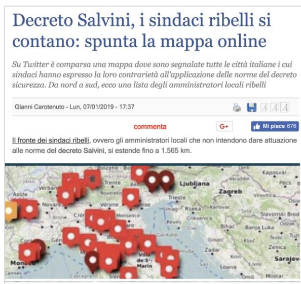
Figure 5. Acknowledging the map on national press.

The map also became a tool to recall the resistance beyond its concrete presentation: in the webpages of Internazionale , the map lives in the form of a mere link (Figure 6).