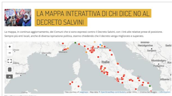
Figure 8. Stimulating inter-actions through the map.

Facebook comments relaunched the map, which came to function as a sort of imaginative projection for people opposing the anti-immigration decree. In other words, as in the comment reported below, the map showed something of an invitational quality as if it were able to stimulate further protests: the map was inviting local actors to take part in it (Figure 9). The cartographic visualisation of those data was provoking emotions (Kennedy and Hill, 2017) (Figure 10).