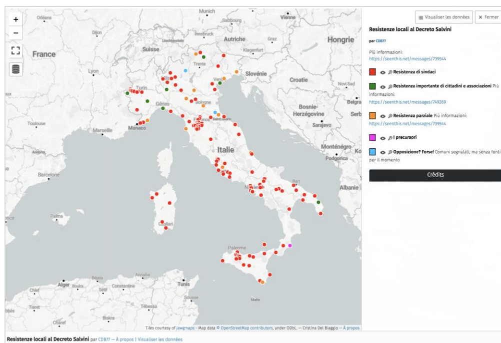
Figure 1. Publishing the map. Resistenze locali al Decreto Salvini [Local resistance to the Salvini decree] , by C. Del Biaggio.

(Cristina Del Biaggio, originally in French; https://visionscarto.net/italia-resistenza-sindaci ).