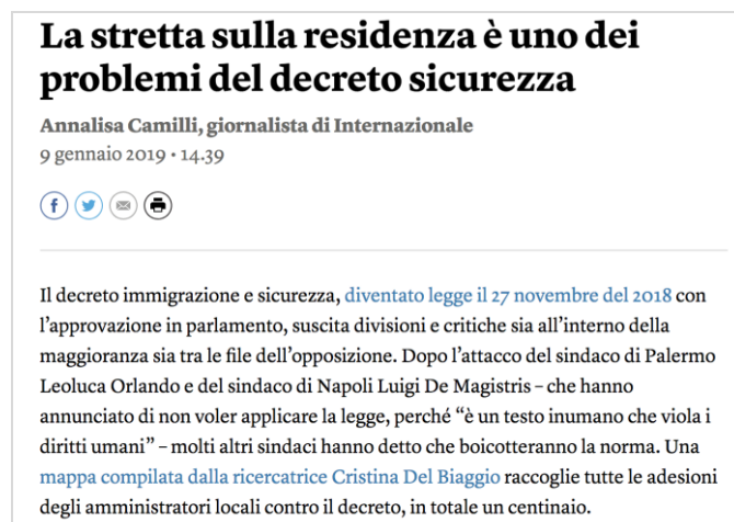
Figure 6. Linking to the map.

The map also became a tool to recall the resistance beyond its concrete presentation: in the webpages of Internazionale , the map lives in the form of a mere link (Figure 6).