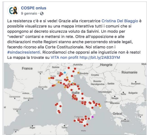
Figure 10. “Resistance does exist and you can see it!”.