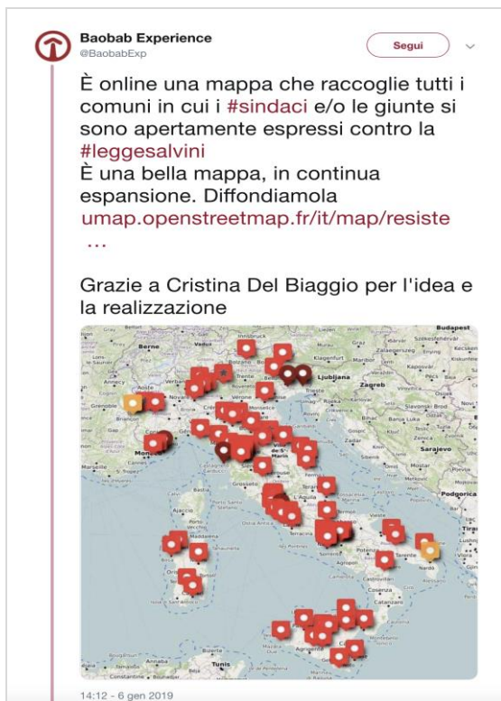
Figure 4. Sharing the map.