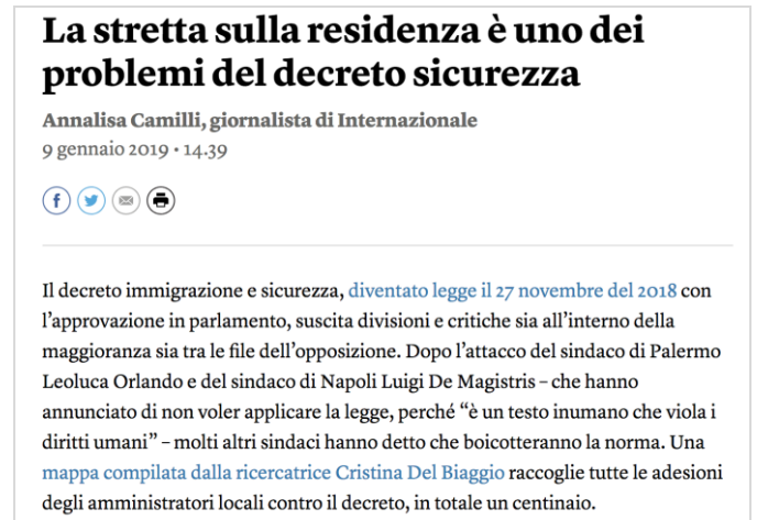
Figure 6. Linking to the map.

The map also became a tool to recall the resistance beyond its concrete presentation: in the webpages of Internazionale , the map lives in the form of a mere link (Figure 6).