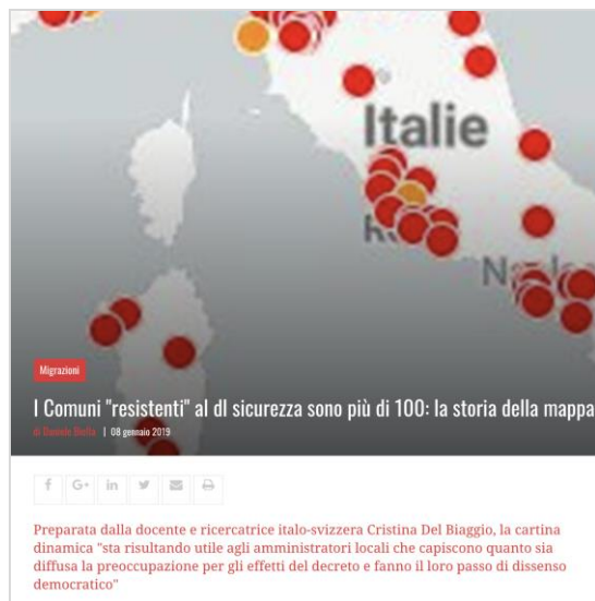
Figure 3. Telling the story of the map.

Local resistance to Salvini's legislative decree, 100 and counting. In a few days more than one hundred Italian Municipalities advanced clear actions against the application of the legislative decree on immigration and security which was enacted by the Italian Government in the Fall of 2018 and is raising serious concerns for its impact on the rights of migrant people. From Palermo to Florence, just to mention the municipalities of the major cities, to small villages all along the Boot, "every municipality is acting by itself but feels stronger because it is not alone", Cristina Del Biaggio explains. She is an Italian-Swiss university researcher and professor working at the Institute of Urbanism and Alpine Geography of the University of Grenoble. Last Saturday, she made a dynamic map of the municipalities opposing resistance to the decree primarily advocated by the Minister Matteo Salvini. A map which, as the hours pass, became filled with red points and now makes visible the growing dissent of Italian mayors of different political colours.