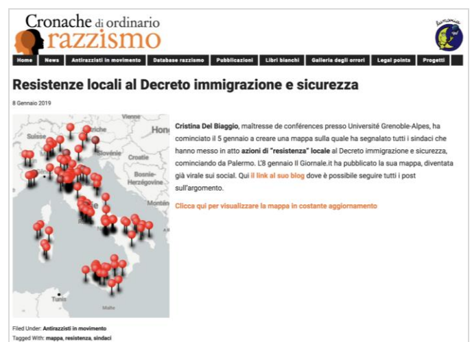
Figure 7. Symbolising the map.

Beyond its proper visualisation, the map has come to symbolise an anti-racist standpoint (Figure 7). Living in the Web through different forms of mediation, the map began not only to attract comments but it came also to activate relations and “inter-actions” (Figure 8).