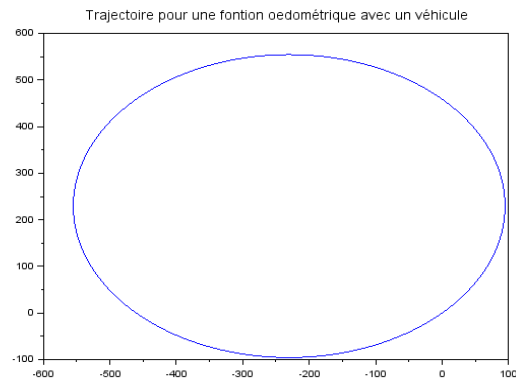
Figure 2 : Simulation completed with the delta of 0.02 rad

Secondly, we want to make a guidance with the equations of the automation of the intelligent vehicle, with the linearization of the odometric model and fed with the commands of the automation.