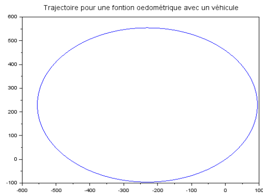
Figure 2 : Simulation completed with the delta of 0.02 rad

Secondly, we want to make a guidance with the equations of the automation of the intelligent vehicle, with the linearization of the odometric model and fed with the commands of the automation.