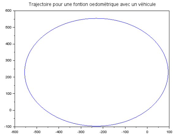
Figure 2 : Simulation completed with the delta of 0.02 rad

Secondly, we want to make a guidance with the equations of the automation of the intelligent vehicle, with the linearisation of the odometric model and fed with the commands of the automation.