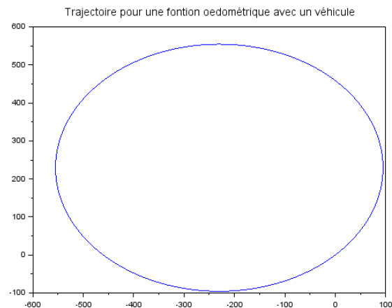
Figure 2 : Simulation completed with the delta of 0.02 rad

Secondly, we want to make a guidance with the equations of the automation of the intelligent vehicle, with the linearisation of the odometric model and fed with the commands of the automation.