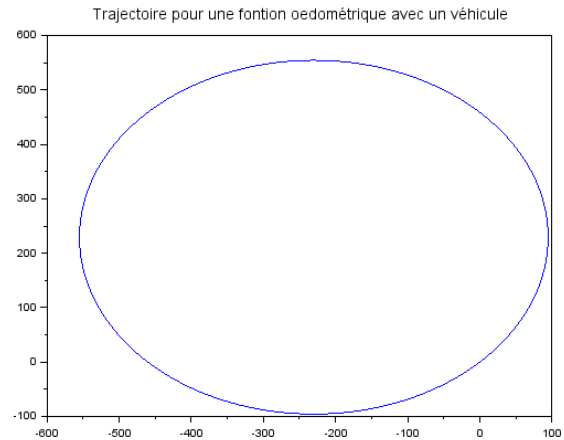
Figure 2 : Simulation completed with the delta of 0.02 rad

Secondly, we want to make a guidance with the equations of the automation of the intelligent vehicle, with the linearisation of the odometric model and fed with the commands of the automation.