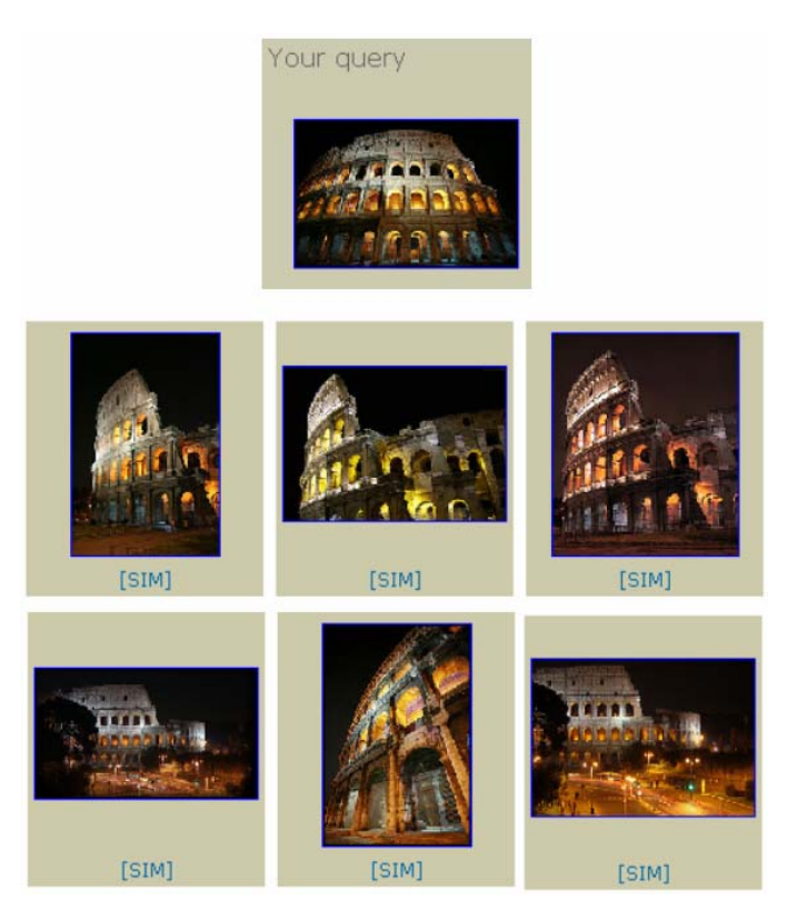
Figure 3: An example of CBIR query

In Figure 3, we present the results of a content-based search for an image of the Coliseum . The closest images are both conceptually and visually close to the query.