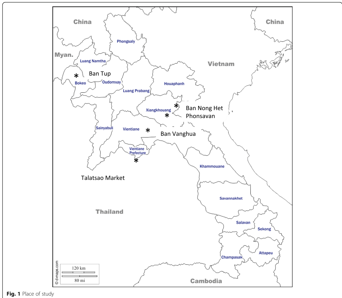
Fig. 1 Place of study

from Vientiane city close to Phu Khao Khuay national park. Specimens were collected at an elevation ranging from 450 to 1000 m in young and older secondary mixed deciduous forests, along creeks banks, in rice field areas, along pathways or in a healer's garden.