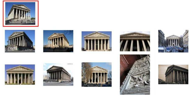
Figure 5. The 10 best result after fusion. The query image is the same as in figure 3 and 4.

For each query image we gather three series of the ten most similar images return by the CBIR system. The first series corresponds to the global color and texture descriptors (see 5.1.). The second series is the result of the bag of features descriptor (see 5.2.) and the third one is a combining of both features based on a late fusion of the similarity scores. The distance provided using the two descriptors is normalized in [0,1] , thus we simply add the similarity values to process the fusion. As for the previous evaluation, for each query and each series, we ask the six students to quote the answer as relevant or not.