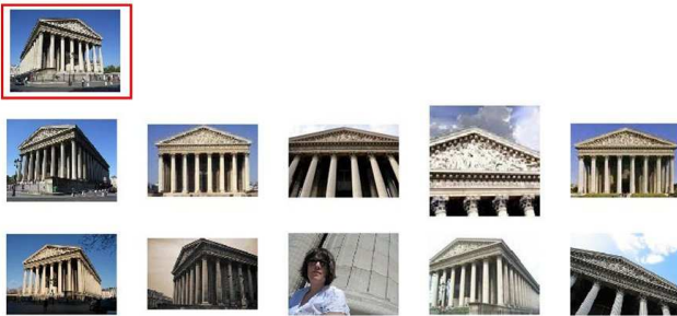
Figure 4. The 10 best result for the bag of features descriptor. The query image is the same as in figure 3.