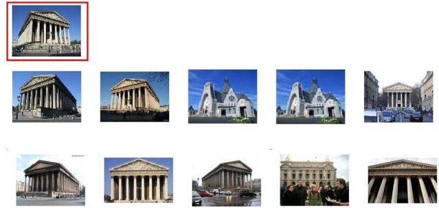
Figure 3. The 10 best result for the global color and texture-based descriptor. At the top-left, the query image.

We quantified the RGB color space in 4 classes for each channel and added a 64-bins color histogram to the two previous texture-based histograms to form the global descriptor h^g . The similarity between two pictures is computed with the classical Euclidean distance.