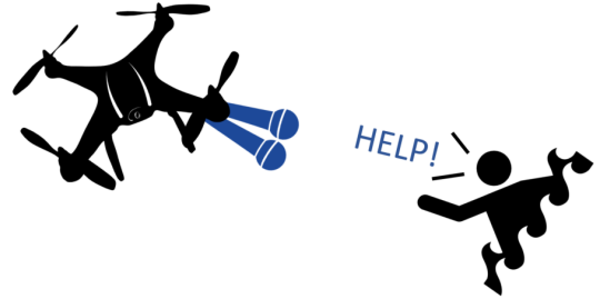
Fig. 1: Microphones embedded in a UAV may help localizing people for search and rescue in disaster areas.