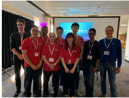
(b) Second place: Team SHOUT COOEE!