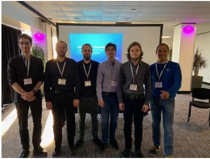
(a) First place: Team AGH