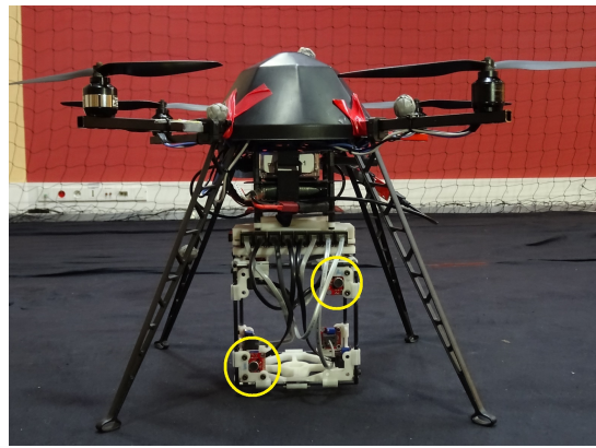
Fig. 2: The quadrotor UAV used for the SP Cup, equipped with a 3D-printed 8-microphone array. Circles highlight two of the microphones.