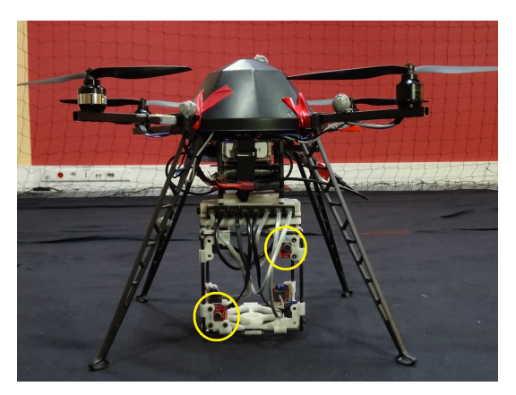
Fig. 2: The quadrotor UAV used for the SP Cup, equipped with a 3D-printed 8-microphone array. Circles highlight two of the microphones.

The goal of the competition was for teams to build a system capable of localizing a sound source based on audio recordings made with a microphone array embedded in a UAV. Teams had to use their signal processing expertise to process the audio signals in order to extract relevant spatial cues to estimate the direction of arrival of a speech source. Key challenges are the large amount of noise present in the recordings due to the UAV's rotors and wind, and the dynamics of realistic flights, involving fast movements. To help noise estimation, the mean rotational speeds of each of the four propellers were provided for each localization task. The microphone array geometry and coordinate frame were also available.