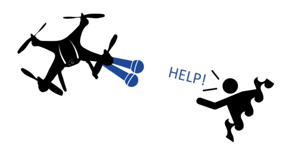
Fig. 1: Microphones embedded in a UAV may help localizing people for search and rescue in disaster areas.