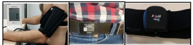
Fig. 1. Wearables sensors

During this experimentation, we used three wearables sensors. The tensiometer Rossmax is used to measure the blood pressure variability. Six measures will be done per day: three in the morning and three in the evening. We intend to measure physical activities by wearing actigraph. This sensor should be worn all the day long. In order to measure emotions among stress, we used the heart rate monitor belt polar H7. We ask participants to wear it at least 3 hours per day. For emotion measurement and specifically stress, we carried out a market study for the existing connected objects. We added to that, a state of the art concerning the sensors and emotion. We seek to reconcile our study needs with the existing offers on the market. We have found that there are different tools and methods for emotion quantification[13] specifically the stress, since it is the factor that accentuates the most cardiovascular diseases. Zhu [5] used the survey approach for stress detection, while Boa [6] was interested more by measuring the saliva and cortisol level. Brush [7] evaluate the fast food consumption lifestyle on cardiovascular disease risk.