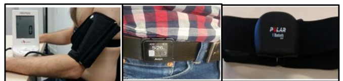
Fig. 1. Wearables sensors

During this experimentation, we used three wearables sensors. The tensiometer Rossmax is used to measure the blood pressure variability. Six measures will be done per day: three in the morning and three in the evening. We intend to measure physical activities by wearing actigraph. This sensor should be worn all the day long. In order to measure emotions among stress, we used the heart rate monitor belt polar H7. We ask participants to wear it at least 3 hours per day. For emotion measurement and specifically stress, we carried out a market study for the existing connected objects. We added to that, a state of the art concerning the sensors and emotion. We seek to reconcile our study needs with the existing offers on the market. We have found that there are different tools and methods for emotion quantification[13] specifically the stress, since it is the factor that accentuates the most cardiovascular diseases. Zhu [5] used the survey approach for stress detection, while Boa [6] was interested more by measuring the saliva and cortisol level. Brush [7] evaluate the fast food consumption lifestyle on cardiovascular disease risk.