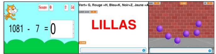
Fig. 3. Interactives games

has led to any change occurred in dietary habits/ physical activities, suggestions.(See Fig4)