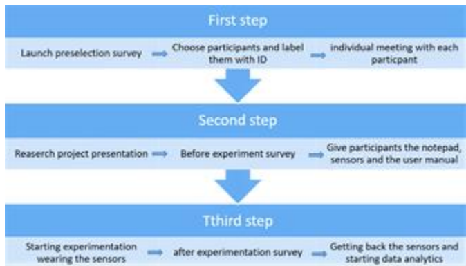
Fig. 2. Study description

While the first phase is about meditation, the second phase is about boosting participants and stressing them. Speed games and cognitive test are being presented to participants in an interactive way (Fig.3.)