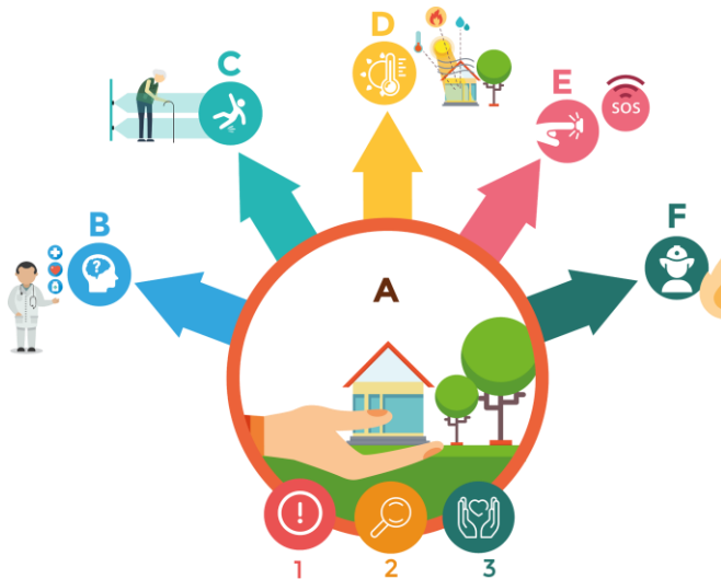
Figure 2. The proposed solution.