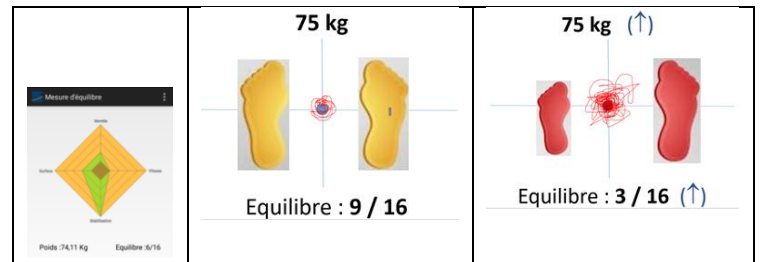
Figure 3. Previous interface (left), new interface

Like for stepping on the BQT, the health professionals were voluntarily left to make sense of the results by themselves, as if they were any user, without information about the indicators and how they are measured or the designers/developers’ intentions and previous research.