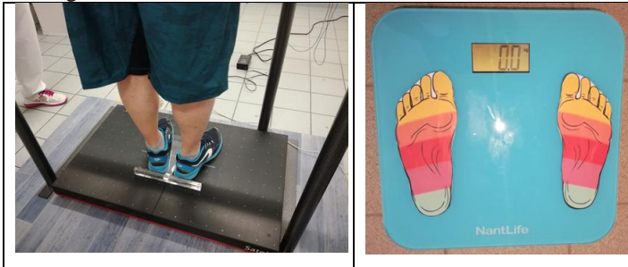
Figure 2. Left: highly standardized position of force-plate Right: standardization at home with BQT

Contrary to the initial design and protocol of the BQT, the force-plate strongly constrains the body position: the feet are positioned by the wedges inserted in the force-plate (picture left), and the patient is asked to look at the red line projected by the video projector in front at eye level. The position of the feet - glued knees, “duck” feet - is not very pleasant. However, looking at a fixed point in front indeed helps to remain more stable. The absence of any markings on the BQT emerged from the collaborative sessions with the professionals as being a failing.