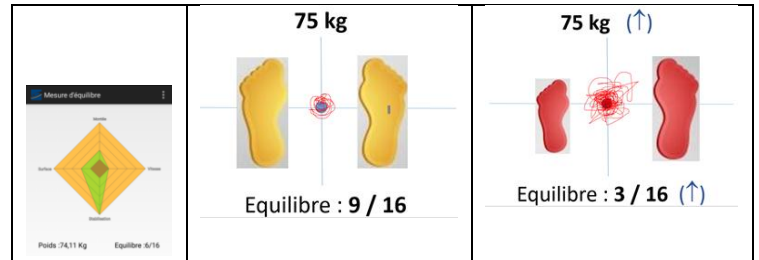
Figure 3. Previous interface (left), new interface

Like for stepping on the BQT, the health professionals were voluntarily left to make sense of the results by themselves, as if they were any user, without information about the indicators and how they are measured or the designers/developers’ intentions and previous research.