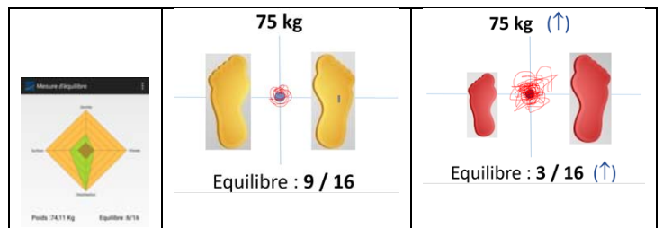
Figure 3. Previous interface (left), new interface

Like for stepping on the BQT, the health professionals were voluntarily left to make sense of the results by themselves, as if they were any user, without information about the indicators and how they are measured or the designers/developers' intentions and previous research.