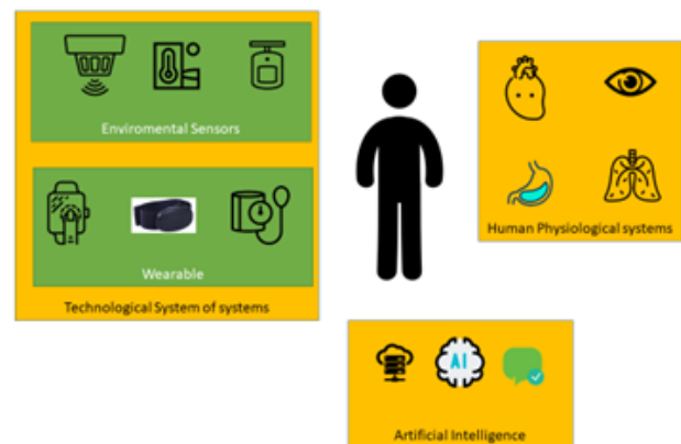
Figure 1 - SoS components

set of structures that are not necessarily dependent, but manageable together for a better performance and a better life style. We have to take into consideration the different connections levels between the persons, their environments and the connected devices. Sensors will measure data relative to human beings, their environments and the interaction between both of them. Emotions and human response are highly related to hormones and to the environment (work, friends, family, among others).