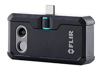
Figure 2: Flir One Pro camera

With the spreading of low-cost digital cameras, imaging technology started to upgrade DFU assessment with the capture of color pictures of the ulcers. These photographs are objective and allow clinicians to diagnose and evaluate the ulcers. Nowadays, smartphones became a viable candidate for image capture and replaced digital cameras. These low-cost devices contain a high-resolution camera and are very familiar for experts and patients. Colour images can be used to analyze different ulcer tissues and also to calculate areas occupied by these tissues more accurately. This image modality could be of great aid to health-care professionals in the assessment of the healing of DFUs.