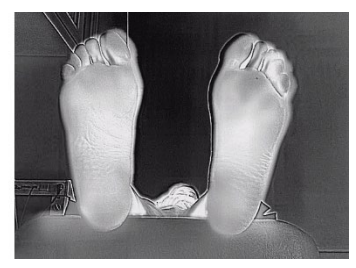
Figure 3: Example of plantar feet surface image taken with a Flir One Pro camera. Thermal mode (a), MSX mode (b).

The proposed system will be composed of a Smartphone equipped with a Flir One Pro camera, to take, at the same time color and thermal image. To combine the thermal image with the visual camera, Flir One uses its MSX image processing mode to analyze the contours of objects for more detailed view. Using this mode, the visual camera displays contours as transparent lines over the thermal image to maximize details and image sharpness (Fig. 3).