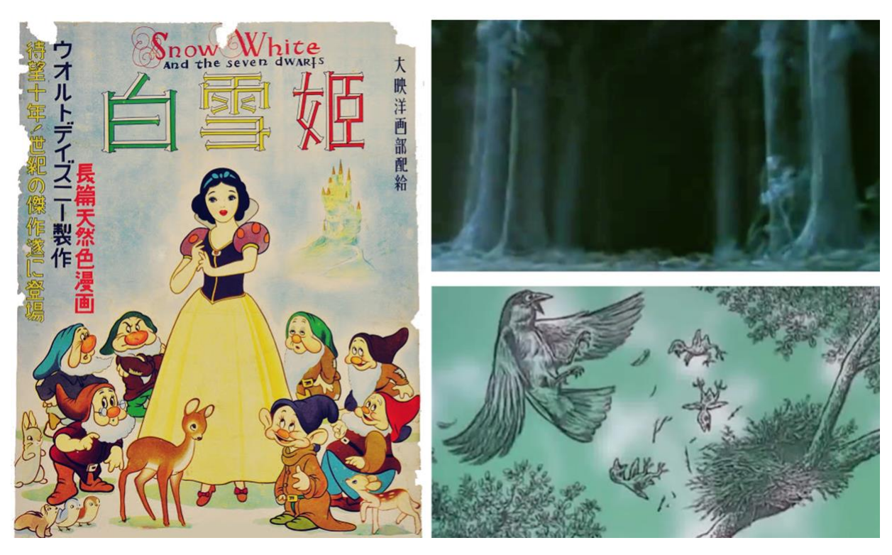
Figure 1 (on the left): The original Japanese poster of Disney's Snow White and the Seven Dwarfs , 1937. Figures 2 and 3 (on the right): Two stills from Mori no Densetsu (The Legend of the Forest) by Osamu Tezuka, 1987.

"I have a great respect for Walt Disney. I consider him as the God of animation [...] My desire to follow Walt Disney consistently growed up during the war".