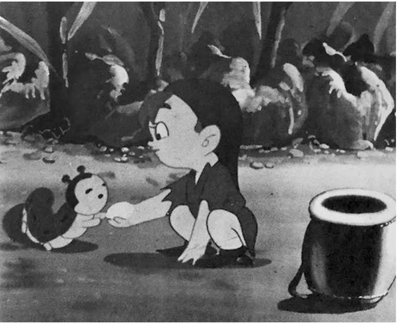
Figure 4 (on the left): Japanese flyer for Snow White and the Seven Dwarfs in 1954. Figure 5 (on the right): a still from Kobito to Aomushi (The Dwarf and the Caterpillar, 1950) by Hideo Furusawa, 1950.