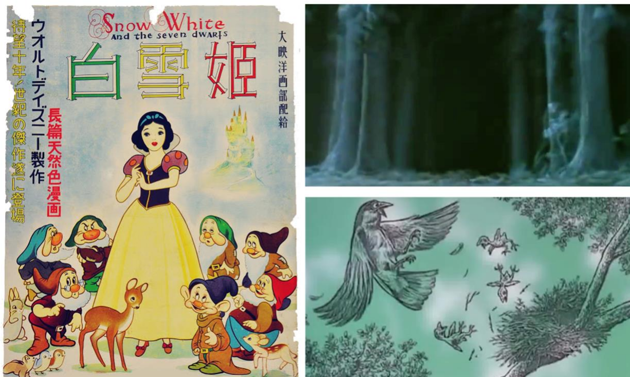
Figure 1 (on the left): The original Japanese poster of Disney's Snow White and the Seven Dwarfs , 1937. Figures 2 and 3 (on the right): Two stills from Mori no Densetsu ( The Legend of the Forest ) by Osamu Tezuka, 1987.

“I have a great respect for Walt Disney. I consider him as the God of animation [...] My desire to follow Walt Disney consistently grew up during the war” 1 .