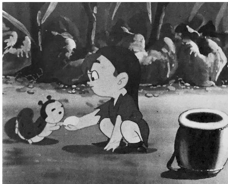
Figure 4 (on the left): Japanese flyer for Snow White and the Seven Dwarfs in 1954. Figure 5 (on the right): a still from Kobito to Aomushi ( The Dwarf and the Caterpillar , 1950) by Hideo Furusawa, 1950.