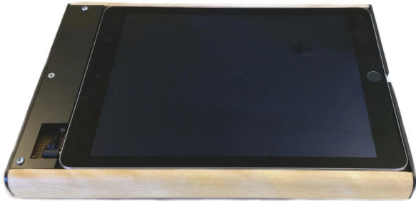
Figure 3: Nuance : a musical instrument using faust2api .

such as the iPad Pro . On the other hand, Android made huge progress (see Table 2), thanks to tremendous work carried out by Google , as well as our completely rewritten audio engine.