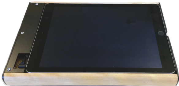
Figure 3: Nuance : a musical instrument using faust2api .

such as the iPad Pro . On the other hand, Android made huge progress (see Table 2), thanks to tremendous work carried out by Google , as well as our completely rewritten audio engine.