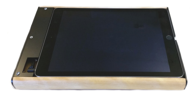
Figure 3: Nuance : a musical instrument using faust2api.

such as the iPad Pro . On the other hand, Android made huge progress (see Table 2), thanks to tremendous work carried out by Google , as well as our completely rewritten audio engine.