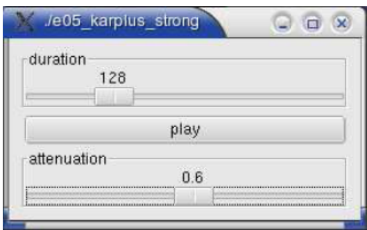
Figure 3: Screenshot of the Karplus-Strong example generated with the jack-gtk.cpp architecture

foo = hslider("duration", 128, 2, 512, 1); faa = hslider("duration", 128, 2, 512, 1); process = foo - faa;