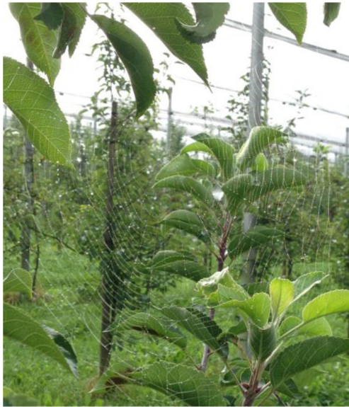
Fig. 1 Spider webs in autumn catch Dysaphis plantaginea migrating back from their summer host Plantago spp., and therefore, prevent the establishment of the next aphid generation causing fruit damage in the following year

in crop damage or to an increased yield are always assumed, but rarely proven (Letourneau and Bothwell 2008). In a few studies, those carry-over effects were discussed (Balzan et al. 2016; Tschumi et al. 2016). For example, flower strips sown nearby winter wheat decreased cereal leaf beetle abundance and consequently reduced pest-induced crop damage (Tschumi et al. 2016). However, not all studies could show this positive effect on crop damage. Sown flower strips in tomatoes increased the abundance and diversity of natural enemies, but did not significantly reduce crop damage (Balzan et al. 2016). There is evidence that pest control does not just depend on increased biodiversity or natural enemy abundance per se, but on promoting the “right biodiversity at the right time” (Letourneau and Bothwell 2008; Pfiffner and Wyss 2004). As a result, Letourneau and Bothwell (2008) emphasized the need for a better understanding of the effects of enhanced natural enemies on pest suppression. Further research evaluating not only the relationship between promoting natural enemies and pests, but also the effects on crop damage and yield is needed to constitute the ultimate aim of promoting natural enemies.