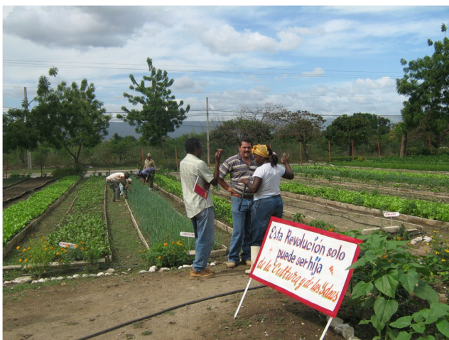
Fig. 1 Organic urban farm (organopónico) Jardín del Caribe, Guantánamo city, Cuba

The primary concerns regarding the addition of trace elements to agriculture soils are the reduction of crop productivity due to phytotoxic effects, water pollution through leaching from soils, and the entry of these elements into the food chain following plant uptake. Trace elements can enter the human body via dust inhalation, dermal absorption, and ingestion of water, soil, and food grown in contaminated sites; ingestion of contaminated vegetables can represent up to 70% of the dietary intake of trace elements (Otte et al. 2001). These elements can also have a significant impact on soil microbiota, altering microbial activity and the metabolism of microorganisms (Bolaños et al. 2016; Hongyan et al. 2016; Muñiz 2008).