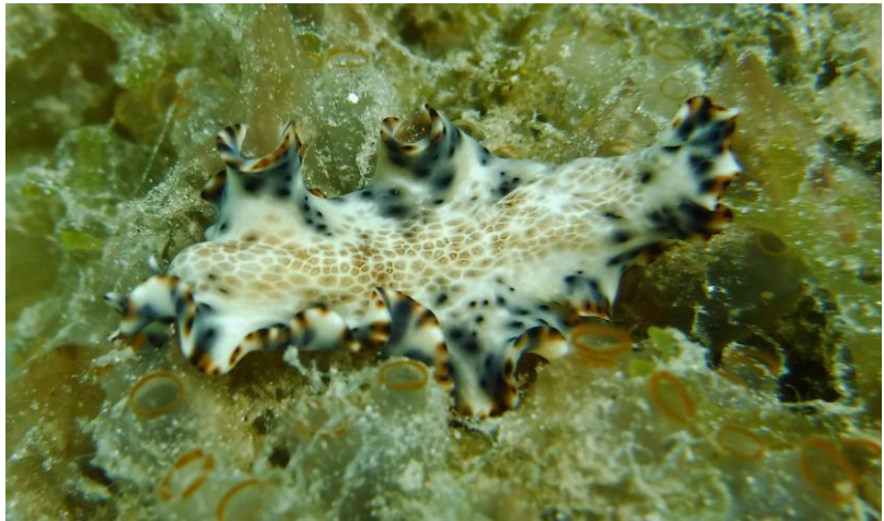
Figure 2i. M. fuscopunctata specimen closely associated with the colonial ascidian Ecteinascidia turbinata at Exiles Bay, Malta