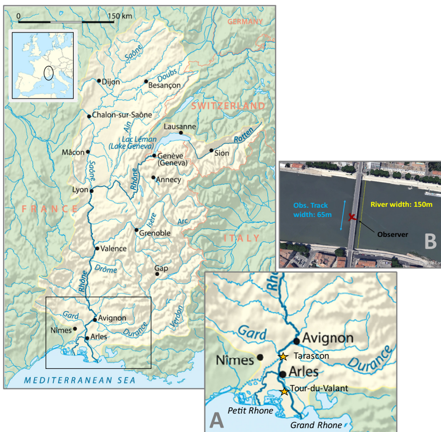
Fig. 1. Map showing the Rhone River from its source upstream Lake Geneva to its estuary in the Gulf of Lion (NW Mediterranean Sea), the position of the river flow (Tarascon) and precipitation and wind (Tour-du-Valant) measuring stations, location of Arles (A) in the “Grand Rhone”, and detail of the observation site (Trinquetaille bridge) (B).