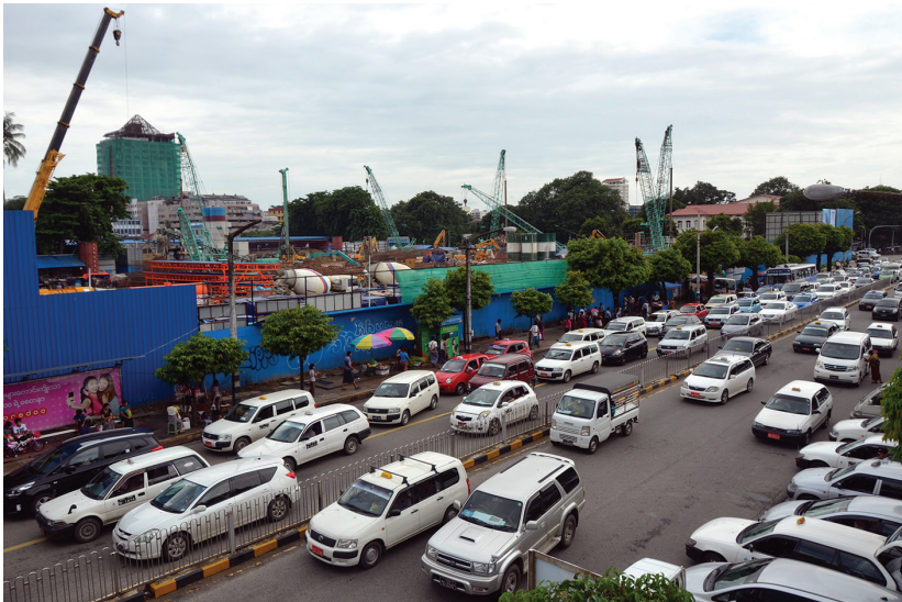
Fig. 3. Traffic congestion in Yangon city core, close to Bogyoke Aung San Market Photo: Marion Sabrié, 13/08/2014.