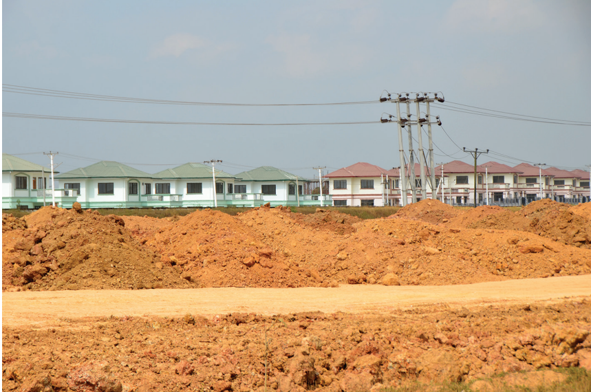
Fig. 4. Housing for workers in the vicinity of Yangon Thilawa Deep Sea Port