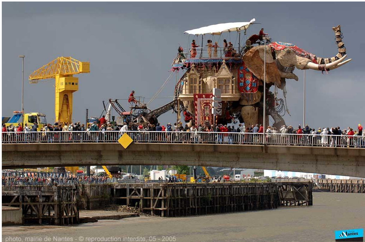
Figure 7. The first elephant

something that cannot be forgotten. Its success was so immense, the love of the city residents so deep for these puppets and their creators, that has completely rejuvenated the city.