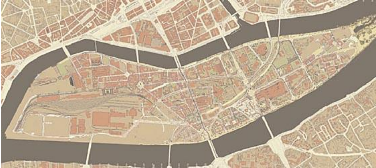
Figure 6. Plan-guide

No specific architecture, no spectacular constructions that would need to be preserved. Long discussions were held between the architect and local associations on what to keep and what to transform. In the end, everybody went to the conclusion to see in this area the ground of intangible heritage composed of knowledge, small histories and a specific way of life. The challenge was to convert it into urban design. First, A. Chemetoff worked on the visual aspect of his drawings. He took the look and feel of city maps that everybody can find at the tourist office. By this, one can have the belief that the project is already done. Then, his main concept was a division of spaces. The industrial area is characterized by vast plots that are not urban scaled. He redrew streets, places, esplanades. For him, no matter those spaces would become, it's just a question of the private/public area. Chemetoff then worked as an archaeologist, tracking all tangible remains of the recent past, to preserve them. He, of course, also protected the cranes as symbolic landmarks of the former harbour. Some industrial buildings are chosen to be renovated. The structure is preserved, the rest is destroyed. New parts are designed to be easily removed. Nothing should last.