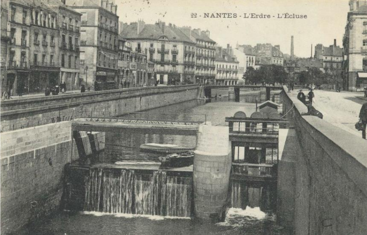
Figure 3. Before the filling of the Erdre

In December 1992, architect Dominique Perrault conducted an exploratory study and drawn major principles of intervention in the city of Nantes [Perrault, Grether 1992]. In his chapter called. “Method”, the architect considers unrealistic to establish a general plan for the development of a vast territory. Interventions must register different and concurrent topics without hierarchy. He suggested promoting new installations, connections, and participation. Before 2000, Nantes didn't develop by strata, by layer, with a new sheet covering an old one. Each period had conquest a new territory developed it or abandoned it. This resulted in a very strong sectorization with virtually sealed borders and striking contrasts of scale. As a consequence, industrial sites, located in the inner centre of the island of Nantes, turned to lost areas, dangerous zones. It was a dead spot in the very centre of the city.