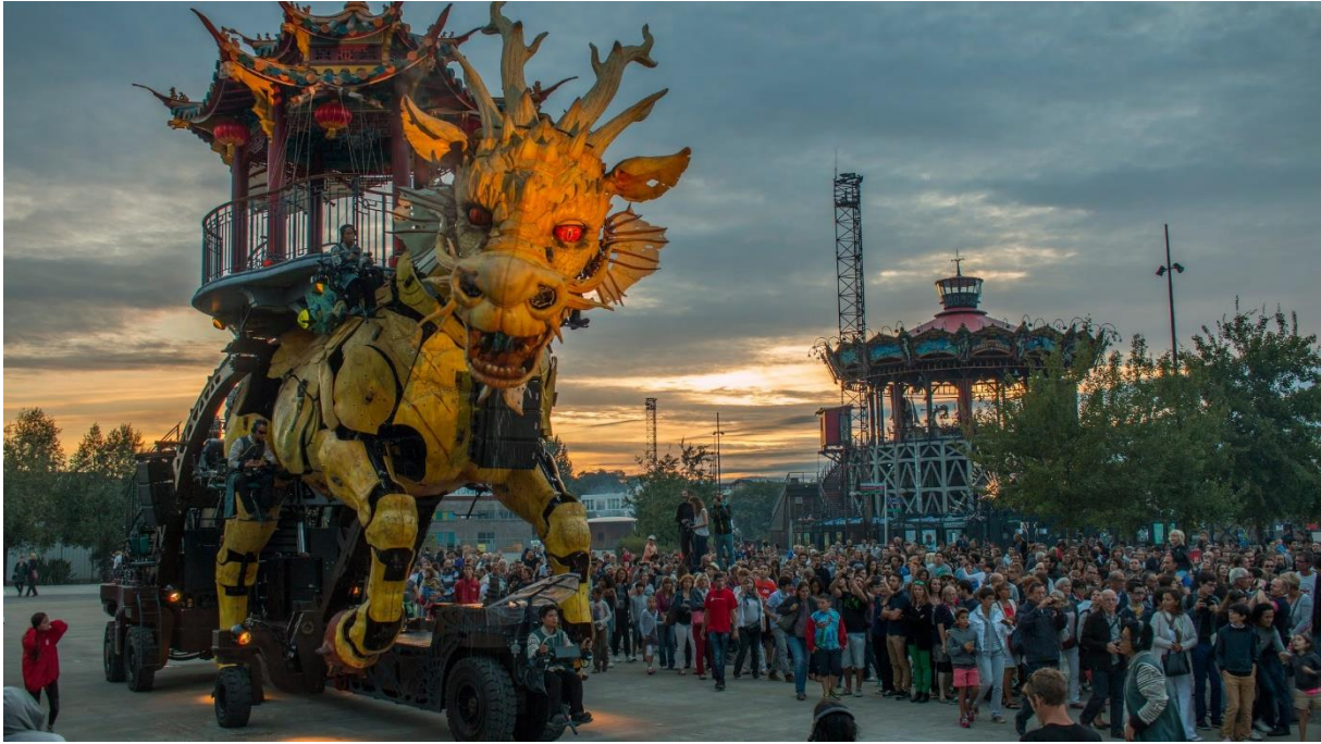
Figure 10.Ma, the Horse Dragon, François Delarozière