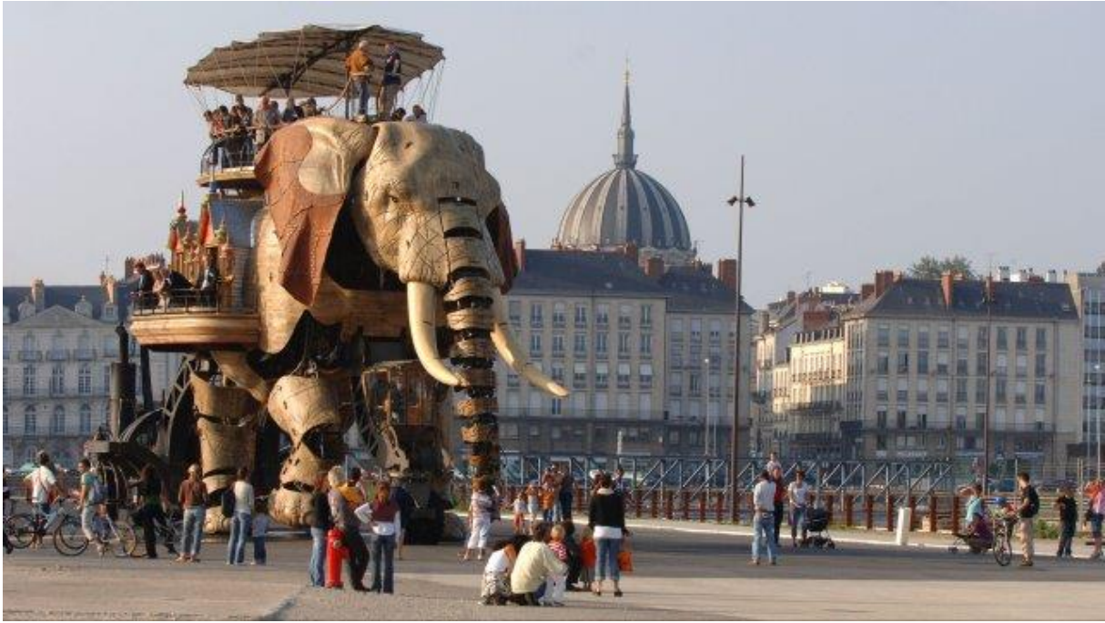
Figure 8. The new elephant, François Delarozière, Les machines de l'île

Is this experience suitable for other cities? Can it be applied elsewhere in France, Europe or China? Bordeaux, Nantes' great rival, moved in the same way, developing what we could now call a narrative urban design . Close to Nantes, La Roche Sur Yon called Chemetoff to repeat his "method" on a very controversial site. Chemetoff asked François Delarozière, the creator of the elephant to imagine a story that would be told all along the works. Delarozière designed mechanical creatures, just like the elephant that the public can operate. This fantastic world of mechanical animals travels around the world. It started with a giant spider in Liverpool in 2008, the Aeroflorale in 2010, in Dessau and last year, Long Ma Jing Shen – the spirit of the Horse-Dragon, in Beijing, China. We can imagine that those fantastic creatures, as they did in Nantes, could help to connect past history, heritage issues and contemporary questions on development, sustainability and well-being.