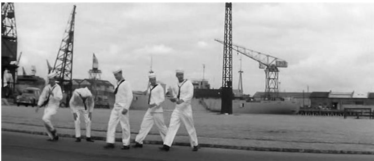
Figure 1. "Lola" Photo: [J. Demy 1961].

To understand the image of a city, the ambiance, one can look at postcards, tourist guides or cinema. Cinema is a good way to see how a city is perceived from a cinematographer point of view, it often reflects what is really in the air, positive or not. Let's take Rome, for instance, after the war, it was a desperate city and films like Roma città aperta (Roberto Rossellini 1945) or Ladri di biciclette (Vittorio De Sica 1948) show a postwar Rome of poverty and violence. In Roman Holiday (William Wyler 1953), the atmosphere is lighter, the sun shines, the characters ride through famous places. Woody Allen in To Rome with Love (2012) shows the eternal city, it's a tourist postcard, an open-air museum. France is also a beloved destination for films and often a romantic place for foreign filmmakers. If Nantes is not as famous as Paris or Nice or Marseille for filmmaking, it's about 20 films that were shot since the end of the Second World War. Famous movies like Lola or une chambre en ville by Jacques Demy, created a fictional reality that visitors wanted to experiment. "Lola" filmed in 1961 shows Nantes as a city of cranes, with a strong shipyard and a dense industrial activity. Docks are full of strong guys, ready for a fight, prostitutes and lost girls. The harbour is certainly not the place to walk the dog.