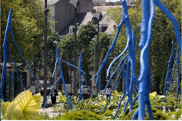
Figure 5. Today's situation