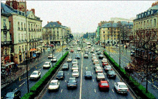
Figure 4. Before the renovation, the flow of cars