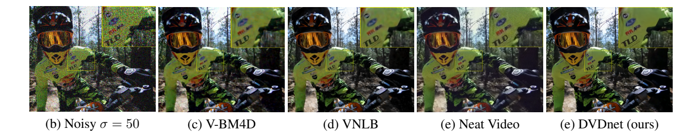
Fig. 3 . Comparison of results. Left to right: noisy frame (PSNR<sub>seq</sub> = 14.15dB), output by V-BM4D (PSNR<sub>seq</sub> = 24.91dB), output by VNLB (PSNR<sub>seq</sub> = 26.34dB), output by Neat Video (PSNR<sub>seq</sub> = 23.11dB), output by DVDnet (PSNR<sub>seq</sub> = 26.62dB). Note the clarity of the denoised text, and the lack of low-frequency residual noise and chroma noise for DVDnet. Best viewed in digital format.

854 \times 480 . The sequences of Set8 have been downscaled to a resolution of 960 \times 540 . In all cases, sequences were limited to a maximum of 85 frames. We used the DeepFlow algorithm to compute flow maps for DVDnet and VNLB. We also compare our method to a commercial blind denoising software, Neat Video (NV [26]).