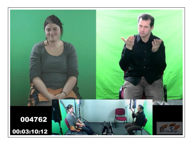
Figure 3: Dicta-Sign corpus [28]: setup for the recording of two signers who are facing each other. Two front views are recorded along with a side view.