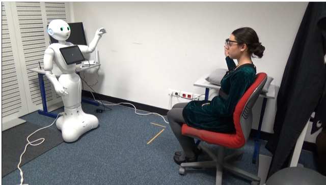
Fig. 3. Experimental setup. The robot is placed in front of the human and waves. The human waves back with its arm supported by a pillow.

To evaluate motor coordination, we compute the average PLV between the human and robot elbow joints. The motion sensors give us a quaternion for each joint. The TEA Captiv-Software is able to reconstruct the joint motion from the quaternions. However, the PLV is amplitude-invariant so we only require a sinusoid for our analysis. For most people, the movement can be seen better on quaternion w which