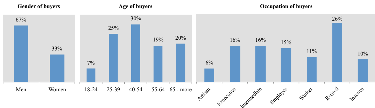
Fig. 1. Profiles of short supply chain buyers.

As mentioned at the beginning of this study, changes in consumption patterns depend on the socio-economic and environmental conditions of the consumer, which strongly influence these choices. Furthermore, it is noteworthy that elderly, retired and often isolated people prefer to visit markets as they are located close to their homes and allow them to maintain social ties. Figure 1 presents a summary of the buyers of short supply chains in France.