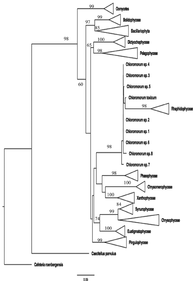
Fig. 3. – Phylogenetic analysis forcing the Chloromorom sequences into the Rhabdophyta for testing the validity of these sequences as members of that microalgal class. Bootstrap support values > 50 % are placed at each node.

designation of type material, and thus is a nomen nudum , which would make also a class name of Chloromorophyceae also illegal. Thus this species will have to be renamed and another class name linked to the new genus name for a valid description of all taxa.