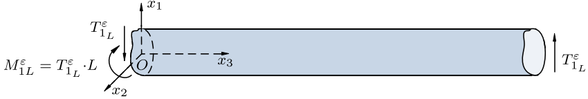
Fig. 3 Loadings applied on the prism (simple bending)

The point C with coordinates (x_{1C}, x_{2C}) is the shear center of the cross section. Its position depends on the geometry of the section and the Poisson's ratio [1]. For a beam with a symmetric plane, the point C is located on that plane. For a beam cross-section with two symmetric planes, C coincides with the surface center.