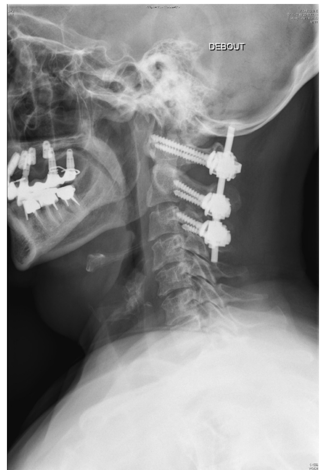
Fig. 2. Posterior C1-C3 fusion.

During follow-up, 2 of the 34 patients experienced complications. In 1 of these patients, who had been managed by posterior fixation, a surgical-site infection required surgical irrigation and appropriate antibiotic therapy, which ensured a favourable