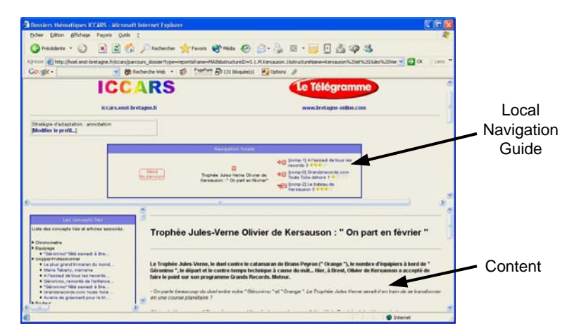
Fig. 3. Web Page layout

From a user interaction, the servlet engine receives an HTTP query with parameters: the component of the query and the names of the XML template, the generic document, the next node and the content of the next web page. The layout composition engine sends these parameters to the logical composition engine. It accesses the XML template with several XML components. For each XML component, a java component requests the semantic composition engine to instantiate its XML component and generates an XML structure. For instance, the local navigation guide component asks the semantic composition engine to compute the previous, current and next web pages of the new one and their equivalence classes. Then, it is able to get an XML structure having these types of links with their parameters and equivalence classes. From these computations, the logical composition engine is able to instantiate the entire XML template and to obtain an XML web page. Then, the layout composition engine generates the web page from the corresponding layout template.